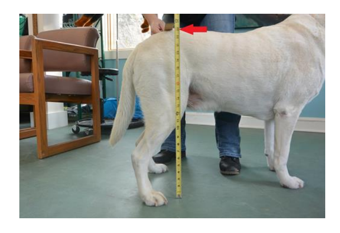
Posted: Fri, Aug 26, 2016 05:29 PM Updated Fri, Sep 25, 2020 12:00 AM by mainadmin

Measure from the floor to the top of the back at the thigh for measurement {\bf J}.